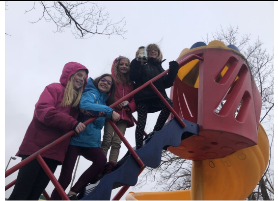
4th grade egg drop

4/29 Lincoln School Carnival-details to come 5/30 No School 6/10 Half day of school with dismissal at 11:40- LAST DAY!!!