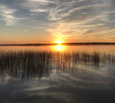
Pay Attention to Joy