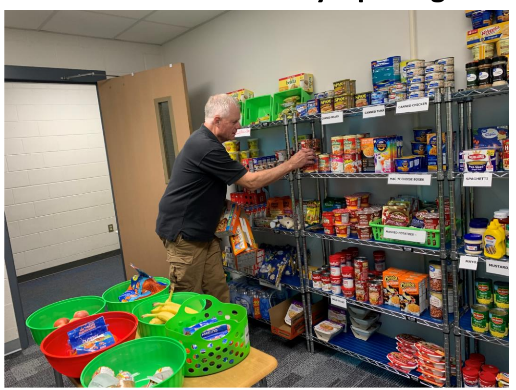
Full Shelves – Friday Opening